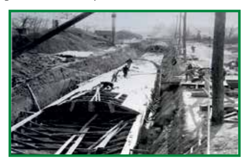
Construction of the Susquehanna Spillway tunnel to the Susquehanna River (circa 1907).

Also coming this summer (around mid July), a "Wildwood Park: An Introduction to Familiar Species" pocket guide produced by Waterford Press will be available for free at the Nature Center Front Desk for families and individuals to enjoy. And if you haven't stopped by the lower level of the Nature Center to step back in time with a few historical photos and maps, make sure to do that. Wildwood's history is rich and full of life and we are looking forward to the unfolding of the next 25 years!