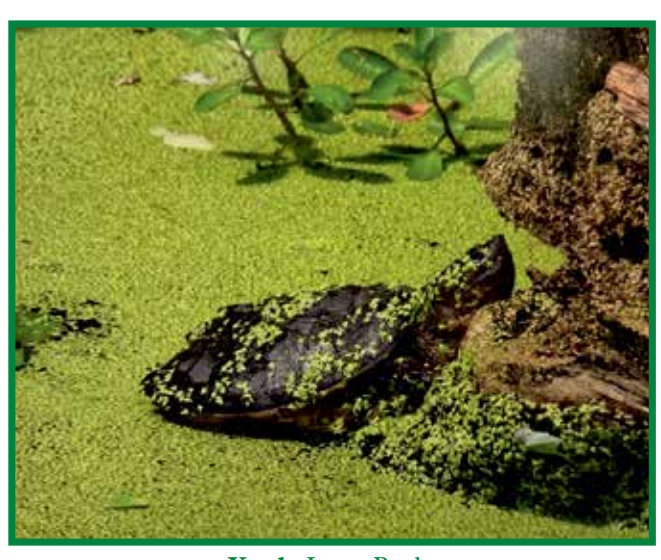
Youth: Jaxon Banks Snappy Turtle