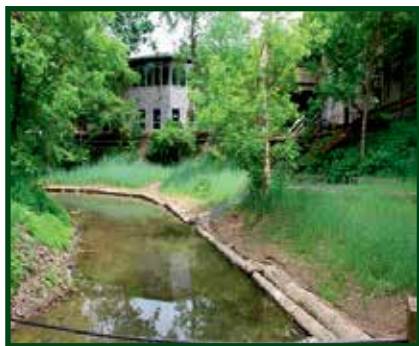
Example of a similar stream improvement in Wildwood (2020)

You can help support this project too by going to our website and clicking on Support.