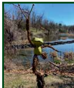
Most Playful: Site #14 "Life is a Balancing Act- sometimes you leap, sometimes you dance" -Lorayn McPoyle