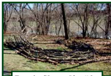
Best in Show: Site #6 "Equilibrium" -Vu Quoc Nguyen

- Art In The Wild' from the section titled 'More Ways to Give'. Or, if you are able to 'balance' your time and would like to support Art In The Wild by visiting the installations in person or by viewing the video of the installations, we know you will enjoy it. No matter how you are able to support Art In The Wild, we're happy you're here!