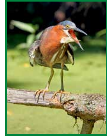
Youth: Phoebe Humpton Under the Surface