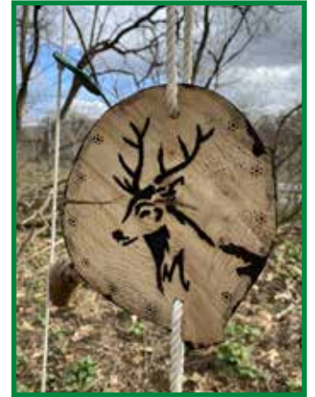
Honorable Mention Student Artist: Site#7 "Earth's Bliss" - Ava King