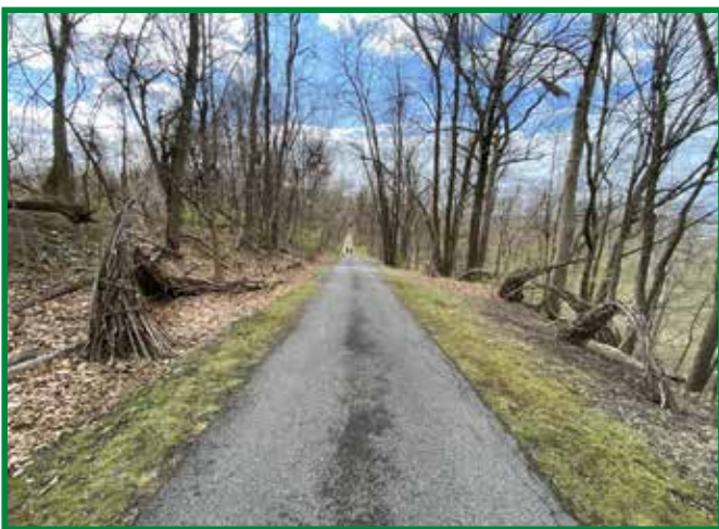
Best in Show: Site#13 "Upon the Cliff" - Steven Reinhart