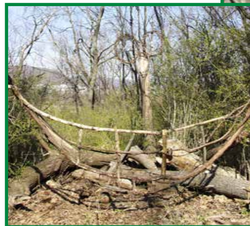
Honorable Mention Family Collaboration: Site#4 "We're laughing with you, not at you" - Marcus Family