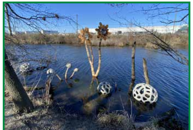
Honorable Mention for Site Placement: Site#18 "Step Right Up" - Raymond Curanzky III