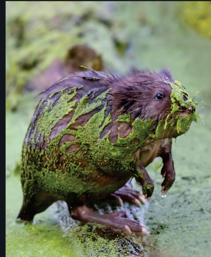
at Wildwood Park