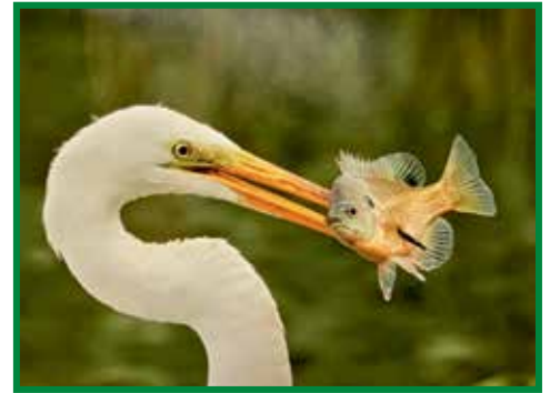
Advanced: Bill Neubaum Catch of the Day