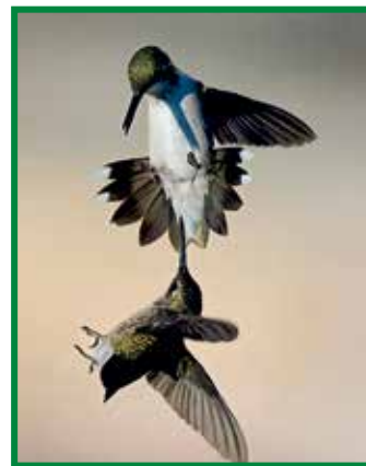
Intermediate: Venkataram Venkatakrishnaiah It's Playtime