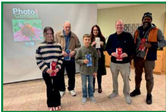
Photo: 2024 Winners present at the Reception