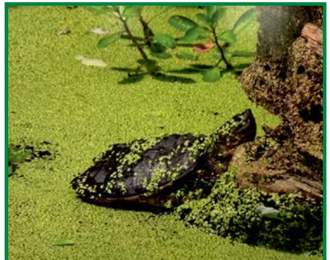
Youth: Jaxon Banks Snappy Turtle