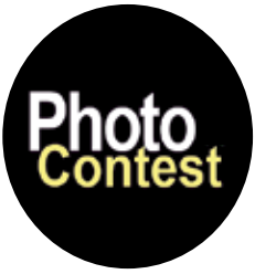
Photo Contest Results

The 2025 Friends of Wildwood Photo Contest displayed 121 photographs this year. Photographers in 3 categories, Youth, Beginner, and Experienced, showcased their best shots of the flora and fauna of our Dauphin County Parks. On December 14, the winning photographs were announced and photographers accepted their prizes. A very big thank you to all of the entrants and congratulations to the winners!